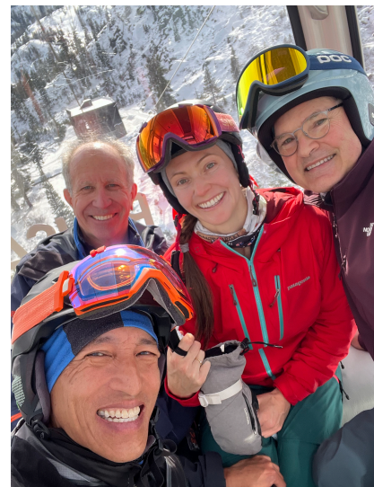
Palisades Tahoe Masters