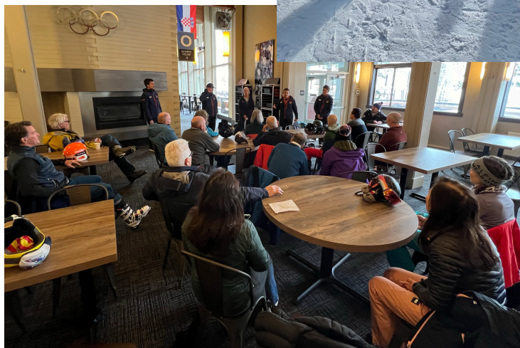
Palisades Tahoe Masters: Early season 23-24 meeting & fun on the slopes